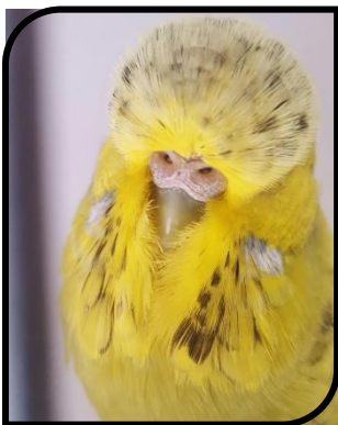
14 SE 735