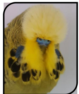
14 SE 767