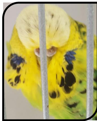
14 SE 701